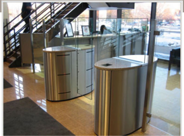
Glass barrier heights are available in 48, 60, or 72 inches

Contact us for more information about the new generation of turnstiles offered by Hayward Turnstiles.