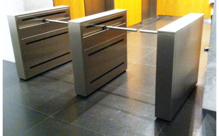
Available in Single or Double Swing Arms

Contact us for more information about the new generation of turnstiles offered by Hayward Turnstiles.