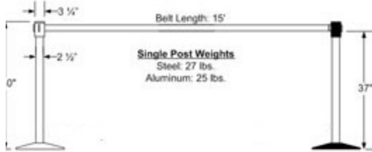
Model 300S - 15 foot belt